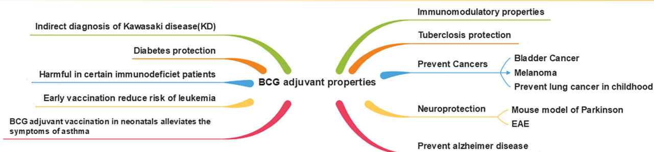
Figure 2. The different effects of adjuvant BCG on components of the immune system and diseases like autoimmune disease and cancers.

Despite its efficacy in non-obese diabetic mice, BCG vaccination is ineffective in preventing diabetes in humans (33, 34). Studies in a mouse model have suggested that BCG vaccination may prevent AD (35).