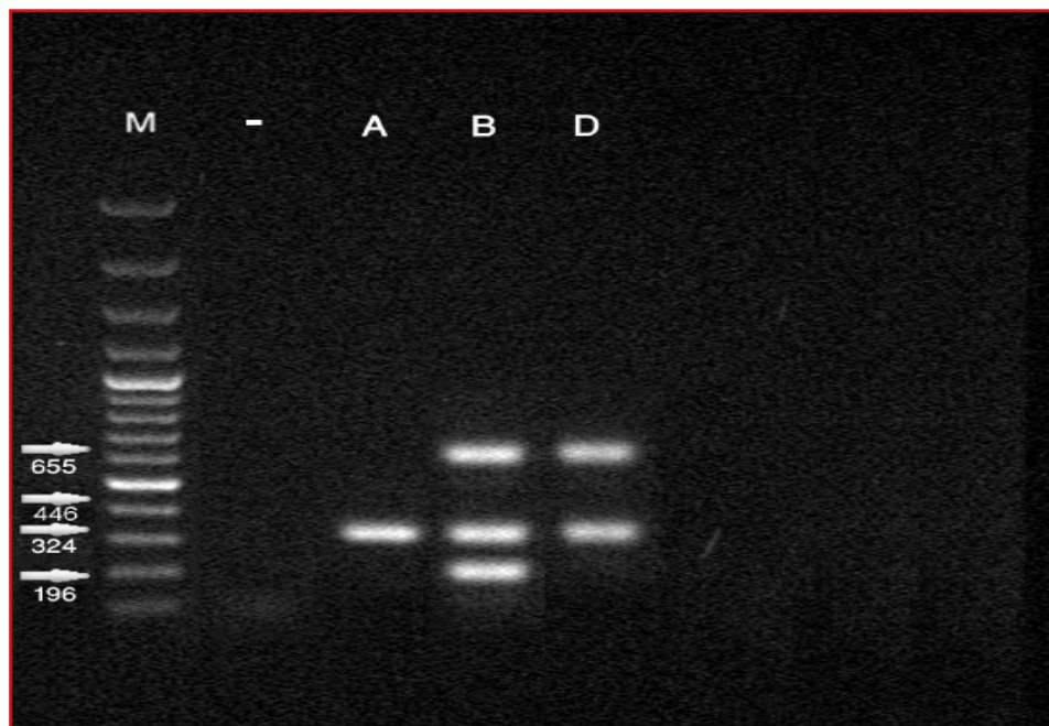
Figure 2. A PCR gel electrophoresis image of C.perfringens types on agarose gel 1% using specific primers. M: marker, -: negative control