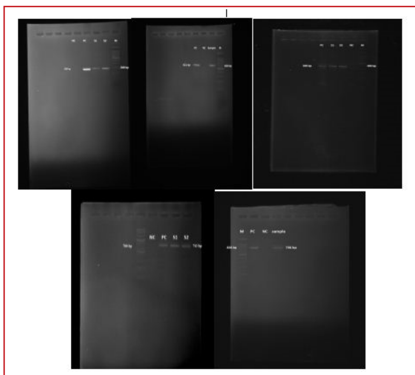
Figure 1. Images related to genotypic study of cluster colonies with carbapenem resistant genes